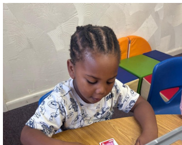
Preschool students working on their math skills in class.